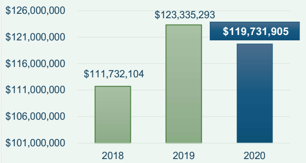
Figure 1: Total Food Imports 2018-2020

The value of food imports fell by $3.6 million (2.9%) from $123.3 million in 2019 (Figure 1). The largest decreases were Coffee and Teas (65.9%) followed by Butter (47.6%); Lamb, Goat, and Sheep (31.9%); Confectionary (27.3%); Vegetables (22.7%); Alcoholic Beverages (21.1%); Seafood (18.1%); and Beef and Veal (14.1%). Conversely, imports of Cane Molasses increased by 240.5%, Pork (49.8%), Sugars & Sweeteners (34.2%), and Fruits (26.7%).