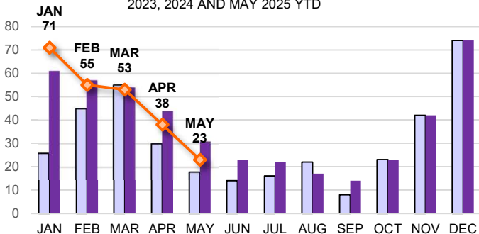
ST. THOMAS CRUISE CALLS 2023, 2024 AND MAY 2025 YTD